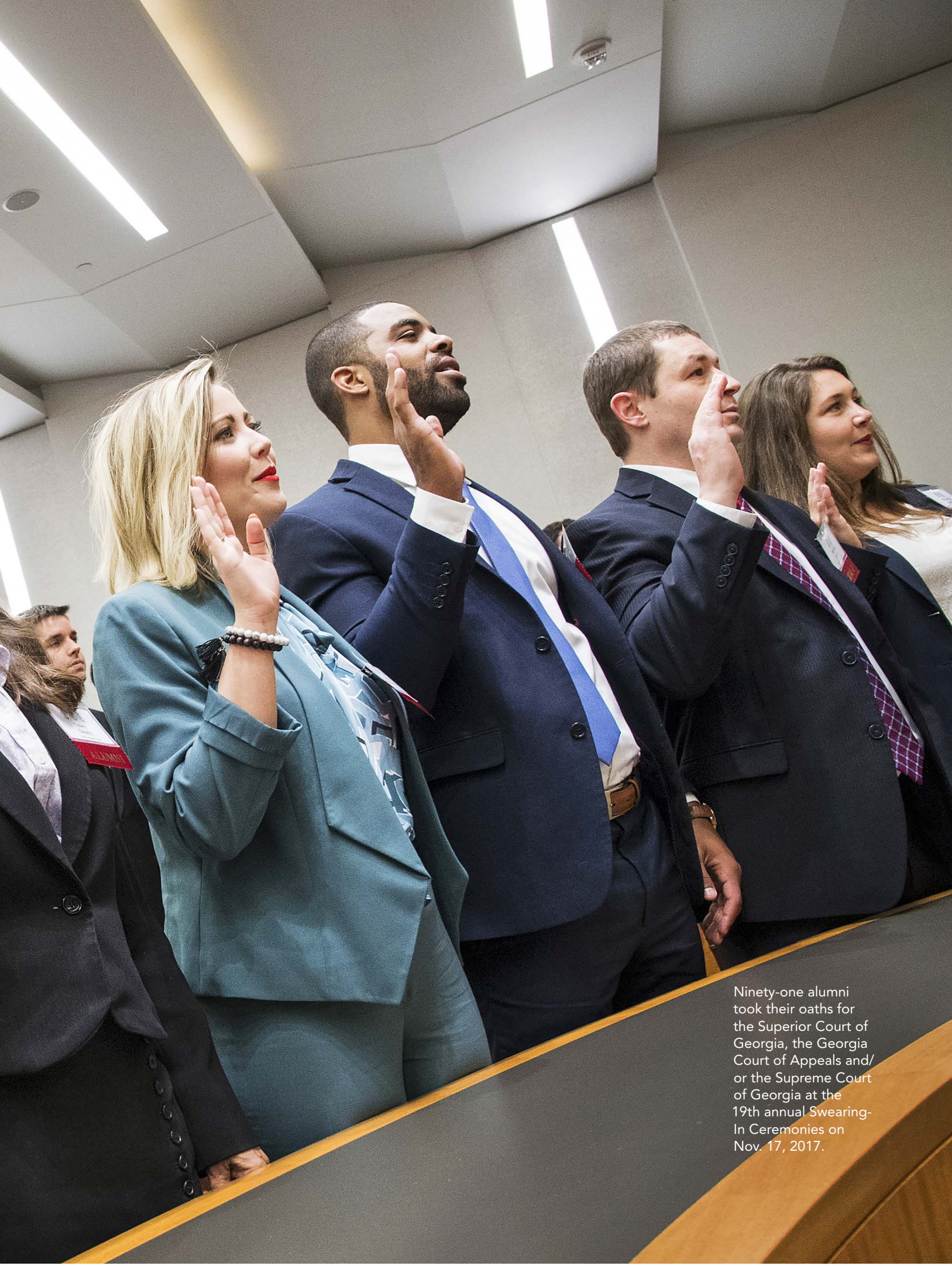
Ninety-one alumni took their oaths for the Superior Court of Georgia, the Georgia Court of Appeals and/or the Supreme Court of Georgia at the 19th annual Swearing-In Ceremonies on Nov. 17, 2017.